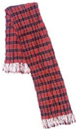
Echo's gathered plaid scarf for the upcoming cold front